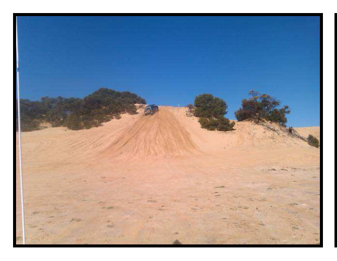
This is one of those "you have to give it a go" hills. Yep, the little Mitsi did make it