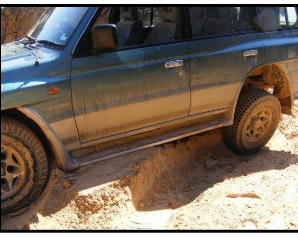
However, there comes a time when having two wheels in the air is not good for progress