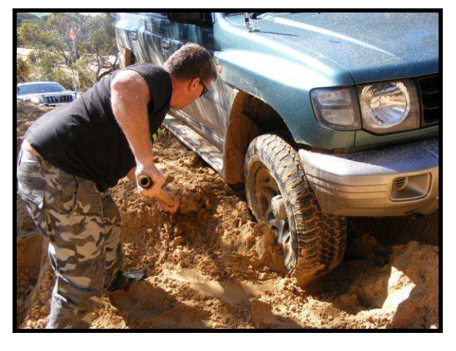
Told you that wet sand it heavy!!