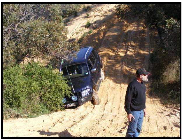
Bother! Was doing so well too!